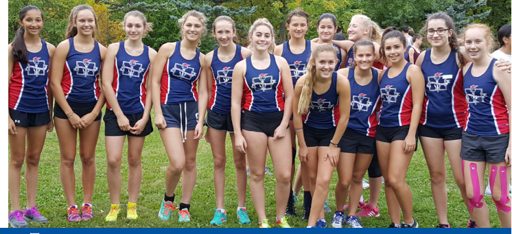
Cross Country Teams